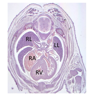
Figure 5: E15.5 Inv<sup>+/-</sup>:Vangl2<sup>F/F</sup>:Nkx2-5-cre+ mouse shows a normal heart. Right lung (RL), left lung (LL), right atrium (RA) and right ventricle (RV).

All 8 embryos of this genotype showed normal results.